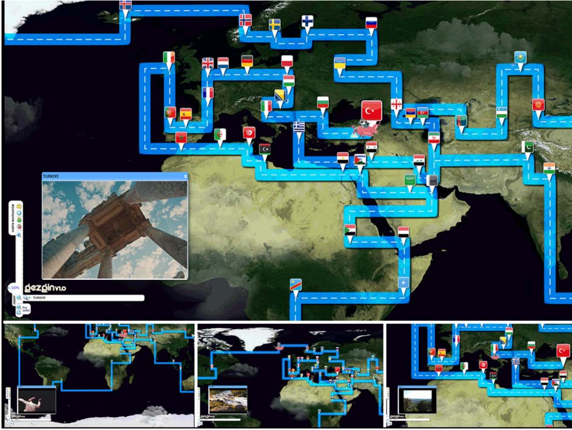
Fig. 2. Gezgin