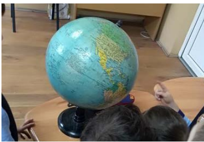
Fig. 3. Observation of the geographical globe and the rotation around its axis

of the planets in the Solar System can be difficult to memorize, we proposed to the students an easy-to-remember phrase. An easy way to memorize the planets in the correct order is the following mnemonic phrase „MĂINE VOI PRIMI MULTE JUCĂRII SAU UNA NEMAIPOMENTĂ” (translate as “Tomorrow I’ll get many toys or an extraordinary one”), where M = Mercury, V = Venus, P = Earth, M = Mars, J = Jupiter, S = Saturn, N = Neptune (Figure 4) ( https://www.twinkl.co.uk/resource/solar-system-planets-in-order-t2-s-928 https://www.twinkl.co.uk/resource/ro-t2-s-409-mnemonic-solar-system-planets-display-banner-detailed-images-romanian ). This exercise was useful, six of the 13 students in the EG obtaining the maximum score on Item 3 of Test 3.