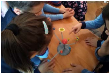
Fig. 5. Observation of the model of the Solar System