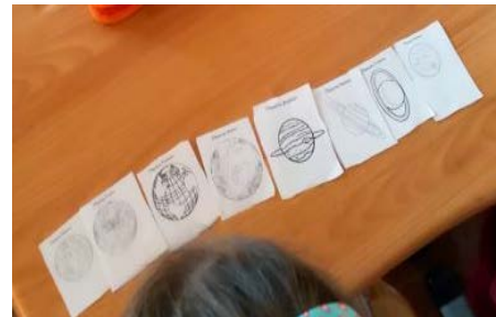
Fig. 6. Observing the planets before colouring