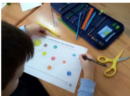
Fig. 7. Drawing and placing the planets from the Sun