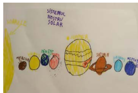
Fig. 8. Representation of the Solar System made by an EG student