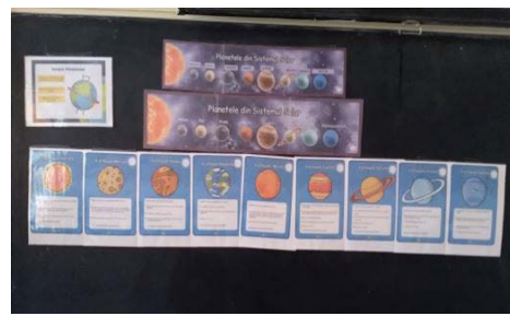
Fig. 4. The illustrative materials displayed on the board