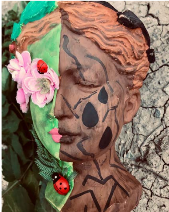
Fig. 3. 3D eco-art project example