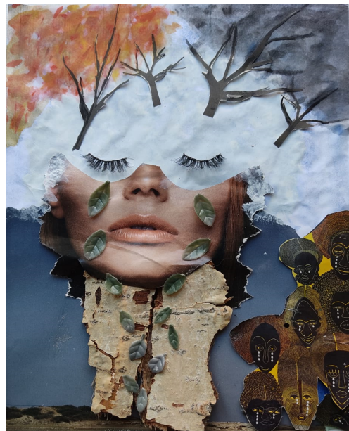
Fig. 6. 2D eco-art project example