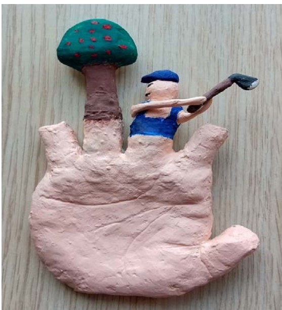
Fig. 5. 3D eco-art project example