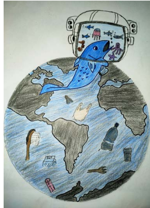
Fig. 4. Eco-art project example